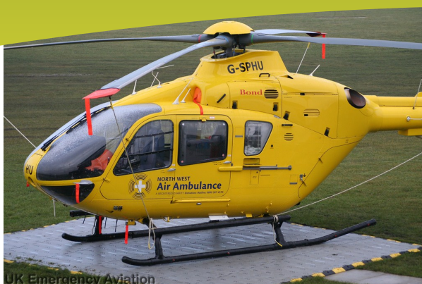
UK Emergency Aviation

This years Presidential Charity - https://nwaa.net/